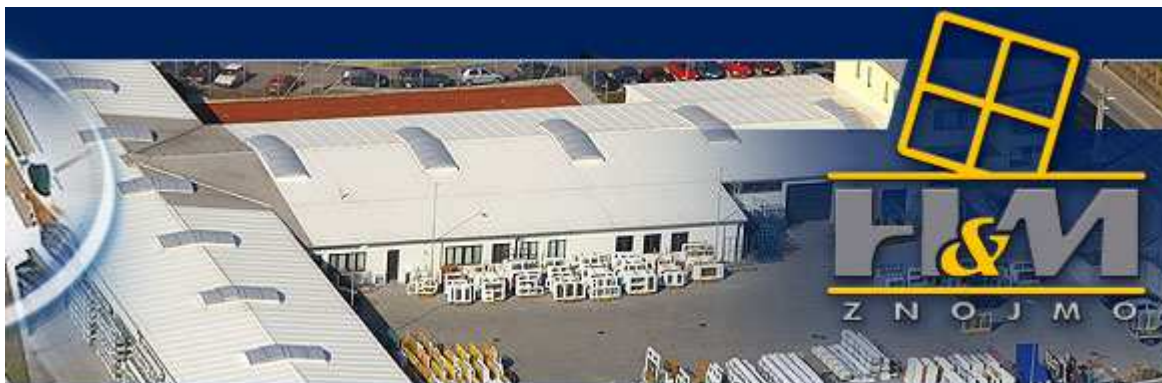
H &M, Ltd – a manufacturer of plastic windows