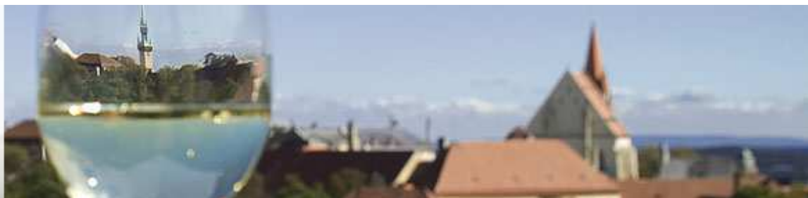
Znovín, PLC, wine producer